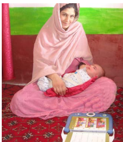
Mother and baby, Afghanistan

Our Birthing Kit Foundation records tell us that over 765,000 kits have been assembled and sent from Australia since the project started. If we add on all the kits that have been made in-country the total number of kits provided to women in disadvantaged circumstances around the world would exceed 800,000. It is a great achievement.